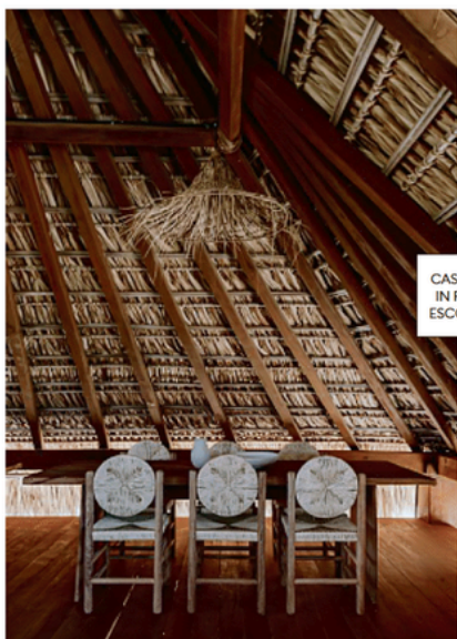
CASA YUMA IN PUERTO ESCONDIDO