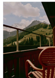
Top: rooms at Casa Yuma. Above: views of the Alps from The Brecon

Balearic cool with a little dose of '60s Tiki shack. The pool room – formerly a public poolhouse – was created in collaboration with German DJ and hip-hop artist Clueso; along with a set of turntables and vinyl collection and an actual recording studio, the (now drained) pool doubles as a sunken event space. The fitness centre has indoor-outdoor yoga studios; the on-site shop stocks picnic supplies and DIY aperitivo ones; and you can cliff-dive directly from the hotel's own gardens into the sea. bikini-hotels.com , from €200 ■HTSI @mariashollenbarger